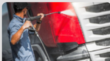
High-pressure & pre-spray cleaner

Click here for the product and application overview