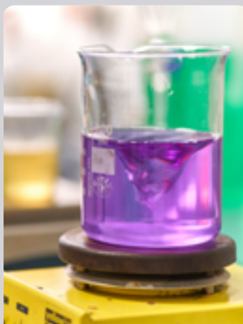
Special cleaners: Cold cleaners & water-based