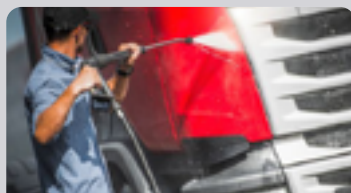
High-pressure & pre-spray cleaner

Click here for the product and application overview