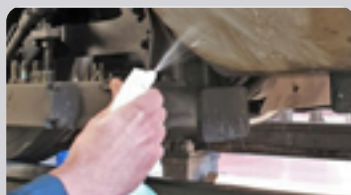
Industrial/workshop/ all-purpose cleaning