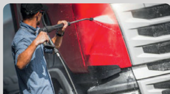
High-pressure & pre-spray cleaner

Click here for the product and application overview