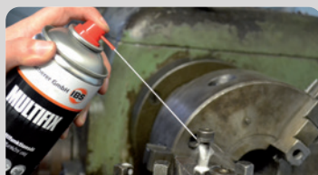
Lubricating/dissolving/ rust protection