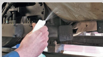
Industrial/workshop/ all-purpose cleaning