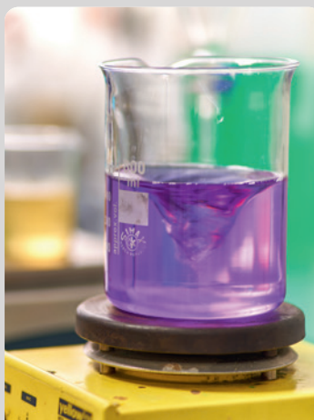
Special cleaners: Cold cleaners & water-based